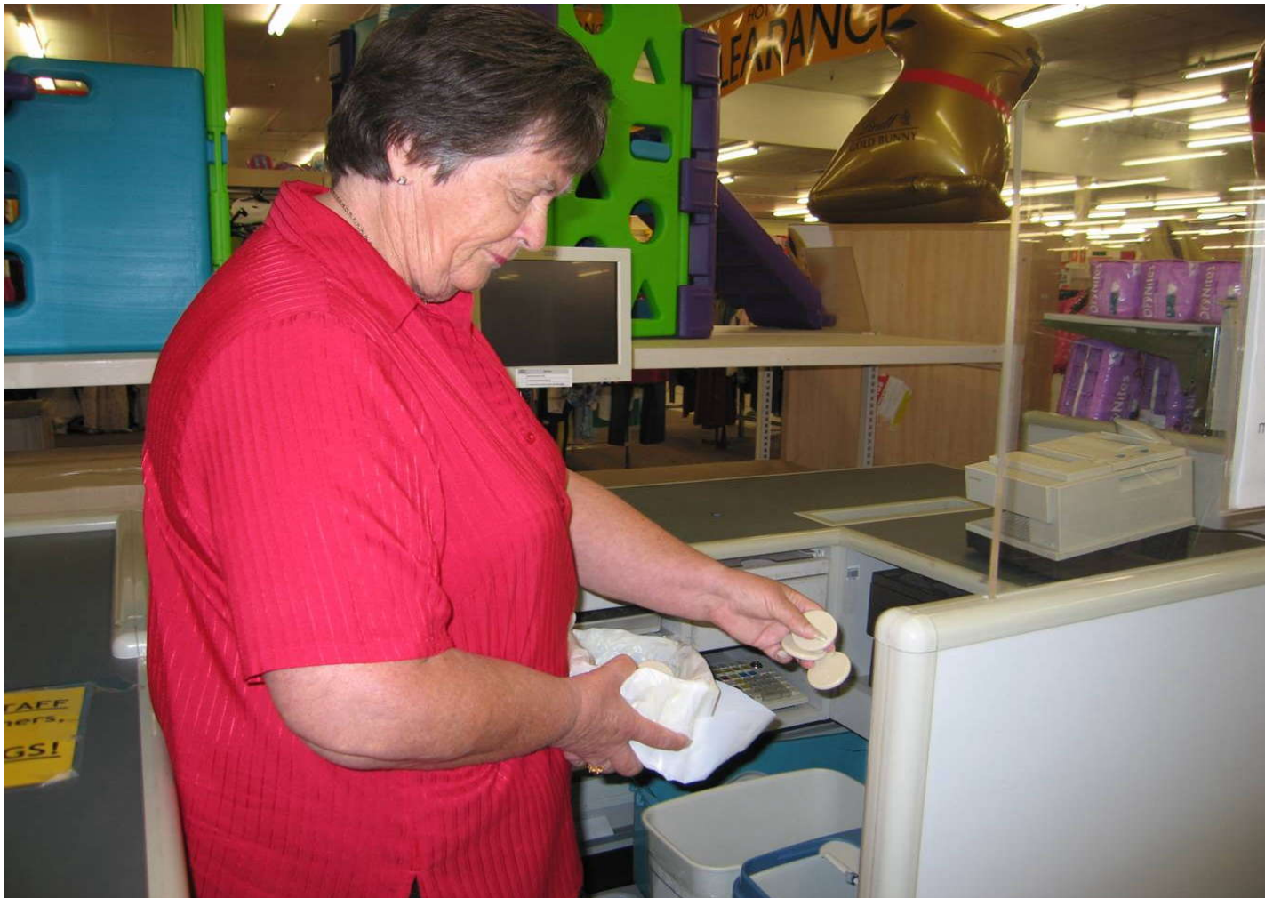
Cashiers removing EAS tags from container and sorting into bins