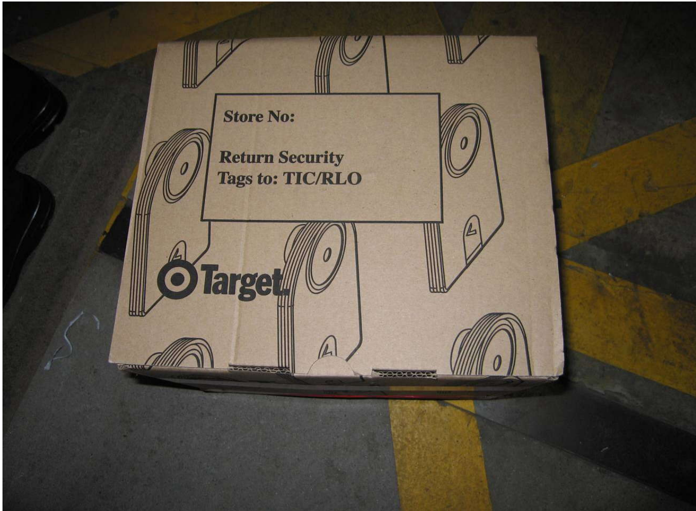
Full box ready for pick-up